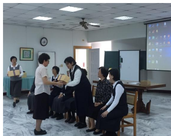
Thanksgiving for out-going