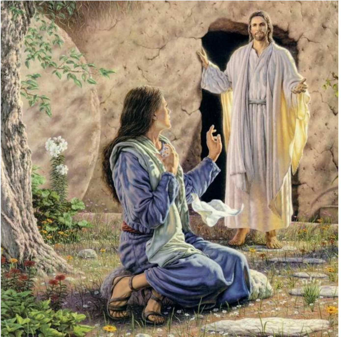
Jesus Has Risen